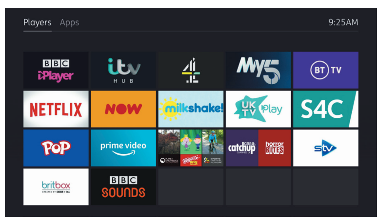
*Britbox Player coming soon

With on-demand services you can watch what you like, whenever you like.